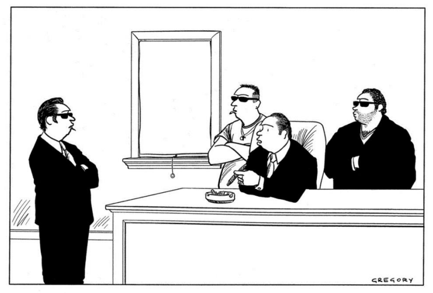
"Interesting business proposal. We'll have to run it by illegal."