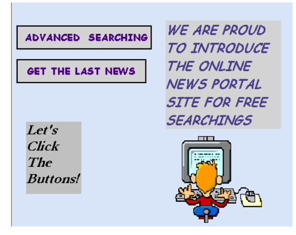
Figure 7: Initial page of the news portal

1. Index Web Form: This is the main entry point into the portal, depicted in Figure 7. It presents a main menu about site content and navigation buttons.