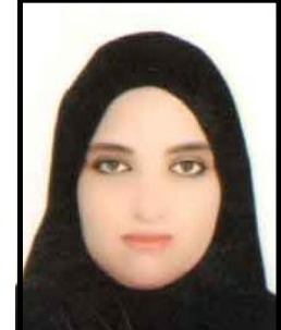
Ph.D. Economics Year: 2015 Nationality: LIBYAN